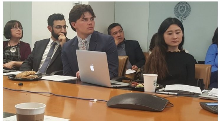
Faculty fellows and student interns listening to presenter