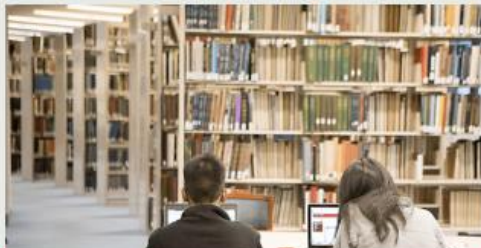
Student Services Dashboard