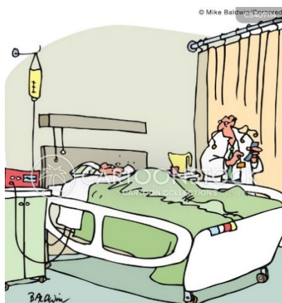
"I'd let you use my phone to call your wife, but I think my battery's dying too."