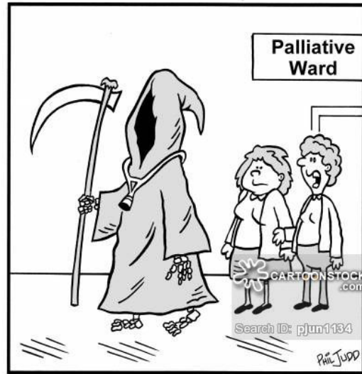
"He's our new Palliative Specialist!"