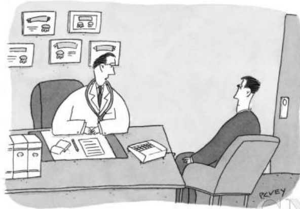
"There's no easy way I can tell you this, so I'm sending you to someone who can."