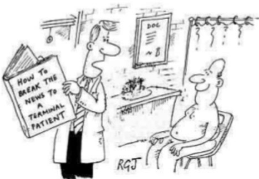
"You have an unusual complaint. Just sit there while I consult one of my textbooks."